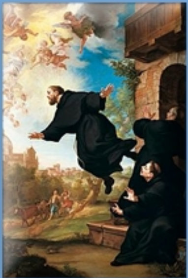
San Giuseppe da Copertino (LE)

Gravity is not changing the Master ... any Saint that Walk on the Seas ... or Fly have conquered